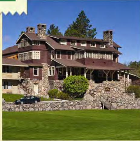
STATE GAME LODGE

The Blue Bell Lodge dining room serves specialties that include buffalo and steak. The general store is close by for picking up supplies. Accommodations include 29 cabins nestled throughout the property.