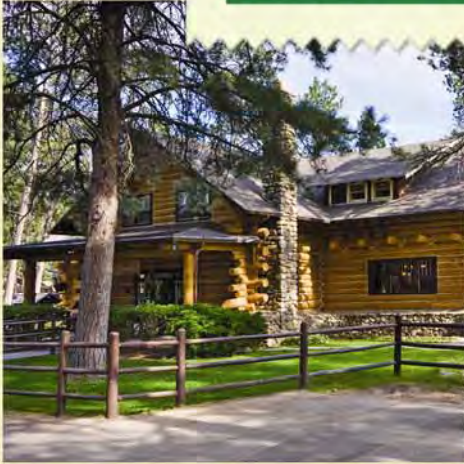
BLUE BELL LODGE

Custer State Park is home to four distinct and diverse lodges. All four lodges offer both ceremony and reception locations along with lodging, activities, general stores and full service restaurants. With such a wide range of awe-inspiring venues, our sales staff is here to help you decide what lodge is right for you. We take into consideration what setting will meet your needs, and provide a foundation for your personalized and unique wedding style. To support you in this process, we have included a brief description of each lodge: