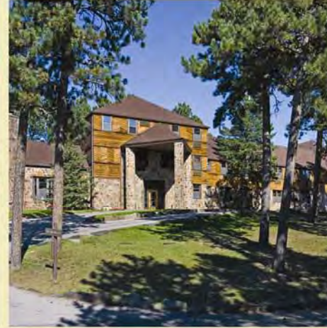
SYLVAN LAKE LODGE

Accommodations range from stately lodge rooms to modern motel rooms and cozy cabins. The State Game Lodge dining room serves South Dakota specialties like buffalo, pheasant and trout.