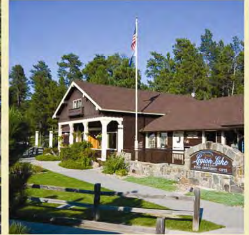
LEGION LAKE LODGE

This property features beautifully renovated lodge rooms and cabins, along with a lounge, restaurant and an outdoor veranda offering amazing views.