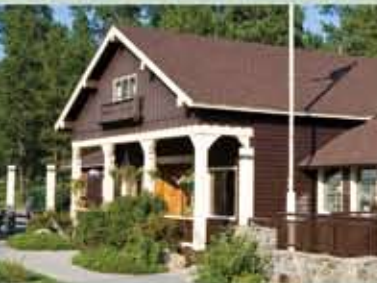
Legion Lake Lodge 605-255-4521