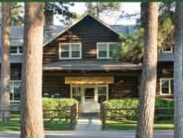
Blue Bell Lodge 605-255-4531