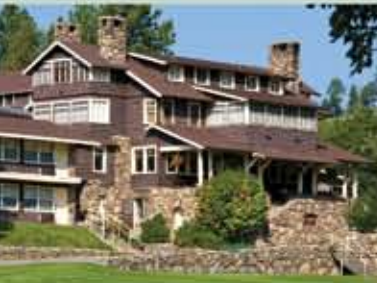
State Game Lodge 605-255-4541