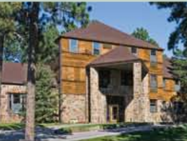
Sylvan Lake Lodge 605-574-2561